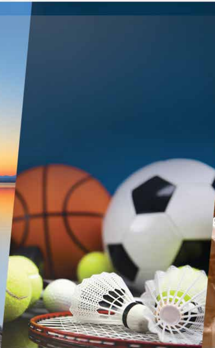
Outdoor & Indoor Games