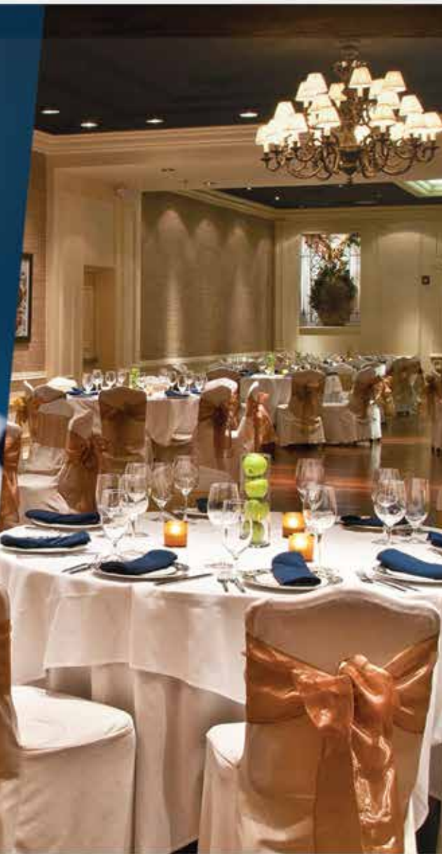
Conference / Banquet Hall