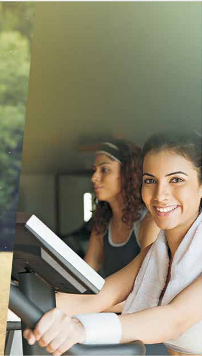
Gymnasium with Steam & Sauna