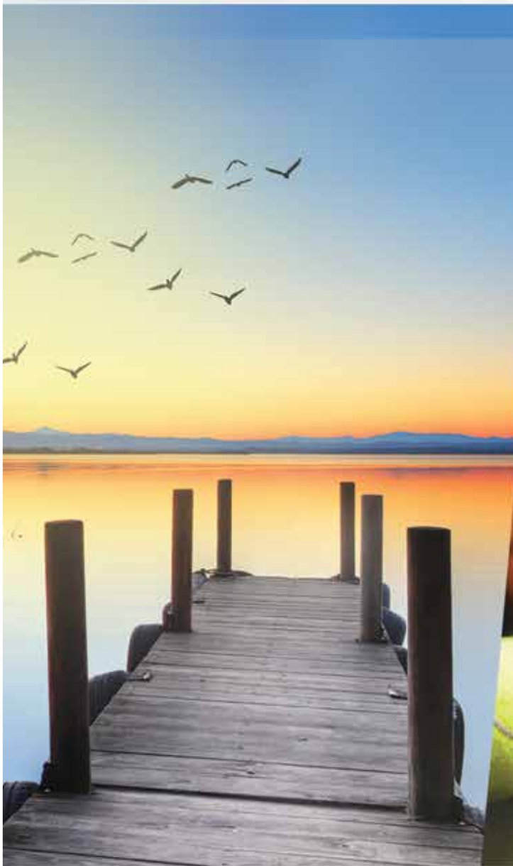
Jetty with Viewing Deck